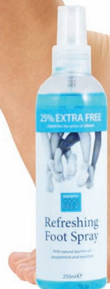
250ml Refreshing Foot Spray