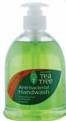
500ml Anti-bacterial Handwash