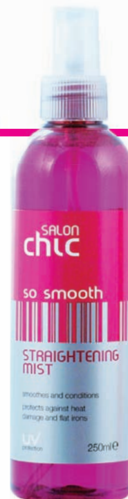
250ml Straightening Mist Transform hair into a smooth sleek style.