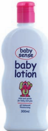
300ml Baby Lotion