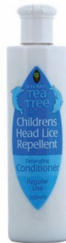
300ml Detangling Conditioner