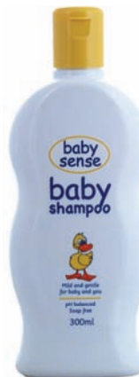
300ml Baby Shampoo

Specially developed with the mildest ingredients to care for baby's skin and hair.