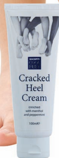
100ml Cracked Heel Cream