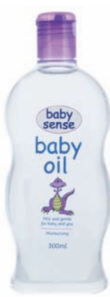
300ml Baby Oil