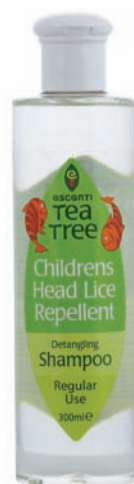
300ml Detangling Shampoo

Especially formulated with pure tea tree oil to help repel head lice and prevent dandruff. Contains a detangling agent to help make hair easier to comb.