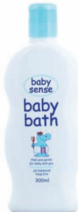
300ml Baby Bath