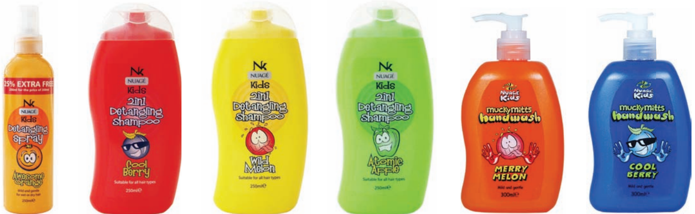
250ml Nuage Kids Detangling Spray Awesome orange detangling spray.

Nuage kids has been created with children in mind. Each product is easy to use, bright, colourful and fun to use. With products for just about every need, struggling to keep those little terrors clean will be a thing of the past.