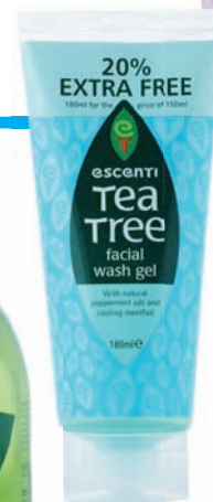
150ml Facial Wash Gel