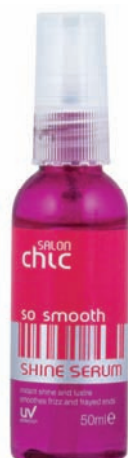
50ml Shine Serum Defrizzes & smooths frayed ends and helps prevent split ends

Customers are demanding the latest salon trends in smooth, frizz free hair. They want a product that offers protection from heat styling damage and UV rays, whilst providing added shine and manageability. Salon Chic So Smooth offers the benefits of salon brands at affordable prices.