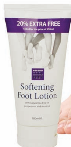
180ml Softening Foot Lotion

With a handy refreshing foot spray, moisturising foot lotion and cracked heel cream, you're sure to leave your feet feeling refreshed and ready for another day on your feet.