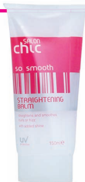
150ml Straightening Balm Tame & protect those unruly locks to create a smooth, straight style.