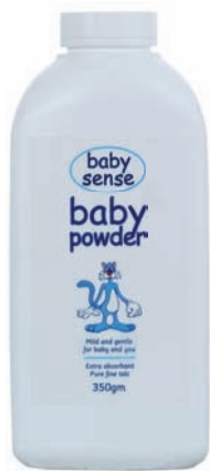
350gm Baby Powder