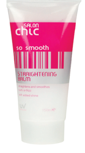
150ml Straightening Balm Tame & protect those unruly locks to create a smooth, straight style.