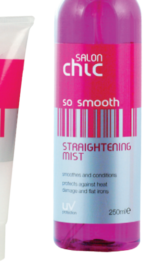
250ml Straightening Mist Transform hair into a smooth sleek style.