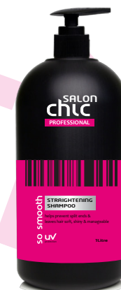
1 litre Shampoo

End your frizz frustrations with the new salon chic professional shampoo and conditioner! Keep your style seriously smooth!