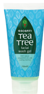
150ml Facial Wash Gel