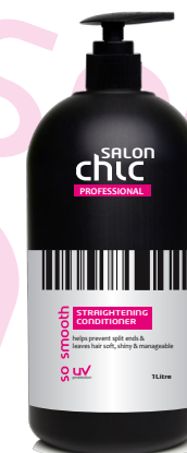
1 litre Conditioner