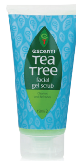
150ml Facial Gel Scrub