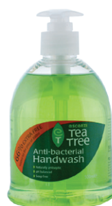
500ml Anti-bacterial Handwash