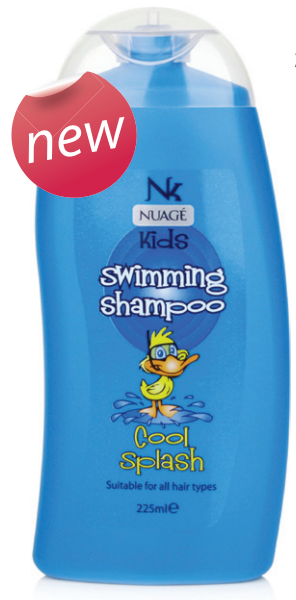
225ml Nuage Kids Swim Shampoo

Nuage kids has been created with children in mind. Each product is bright, colourful, fun and easy to use. With products for just about every need, struggling to keep those little terrors clean will be a thing of the past.